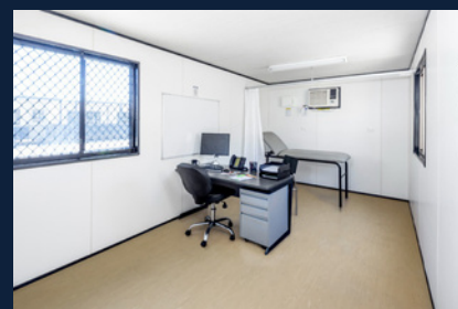
Furnished First Aid Room

To enhance your modular building experience, please contact your local Portacom representative for information about our 360° Solutions range of additional products and services.