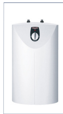
Underbench Hot Water System

* Please note furniture items may vary in appearance from region to region depending on stock availability.