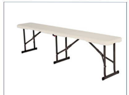
Bench Seat Bi Fold

Ask us about our furnished building kits to cover your project needs.