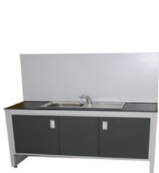
Counter Sink (Cold Water)