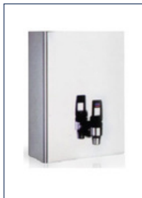
Hot Water Boiler