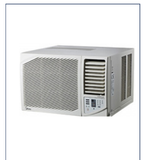
Reverse Cycle AC