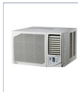
Reverse Cycle AC