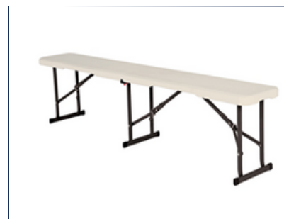
Bench Seat Bi Fold

Ask us about our furnished building kits to cover your project needs.