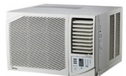
Reverse Cycle AC

Ask us about additional items to cover your office needs.