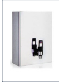
Hot Water Boiler