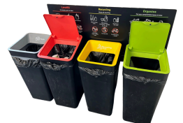
Waste & Recycling Station

Ask us about additional items to cover your lunchroom needs.