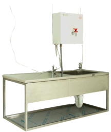
Counter Sink (Cold Water)