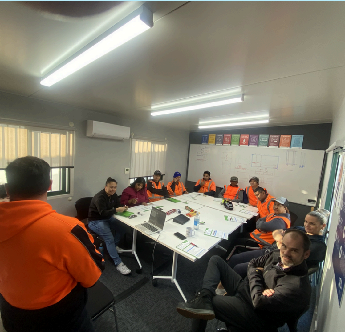
Portacom's team undertaking Connector Training

In April 2024, 16 of our team undertook 'Connector Training' designed to give immediate assistance and care to those in crisis.