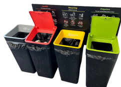
Waste & Recycling Station