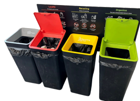
Waste & Recycling Station