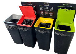
Waste & Recycling Station