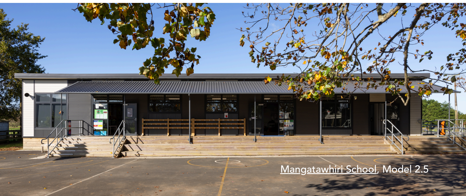
Mangatawhiri School, Model 2.5