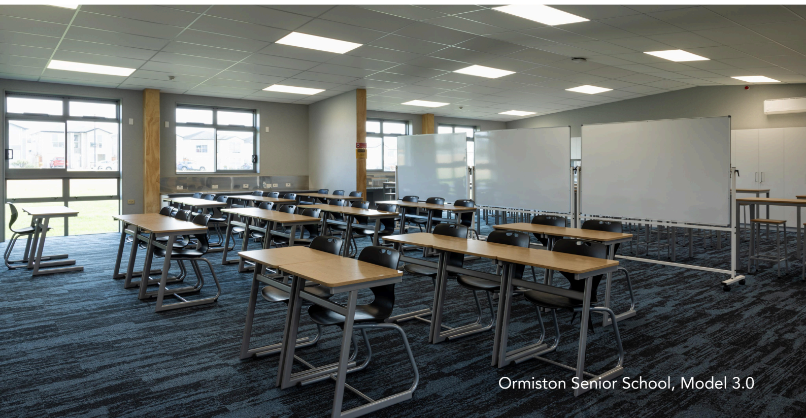
Ormiston Senior School, Model 3.0