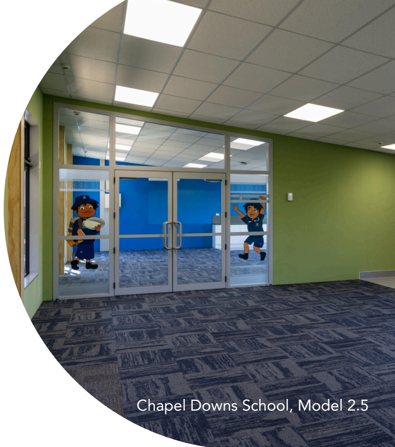
Chapel Downs School, Model 2.5

Perfect for schools that need functional space delivered fast - without compromising comfort or quality.